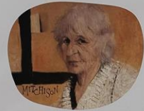
Naomi (Lady) Mitchison, 1897 - 1999. Author Painted by Clifton Pugh